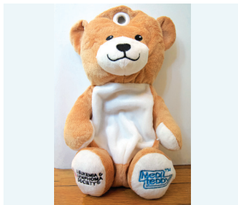
Medi Teddy™ teddy bear that fits over IV and feeding tube bags to conceal the contents)