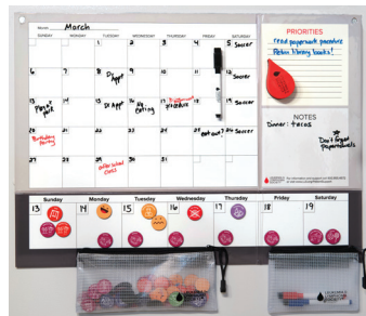
Dry erase/magnetic calendar